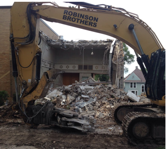
Early in the demolition phase. The original foyer was still standing, but the coatroom, lounge, and sanctuary had come down.

We will move back in some time this fall. Watch for more construction and move-in news on the Beth Israel Center website ( www.bethisraelcenter.org/ldorvador ) and Facebook page, as well as in the next issue of the Centerite.