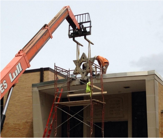
Crews carefully removing the Star of David so it can be restored and remounted above our new entrance.

In May and June, we demolished the eastern half of our building and gutted the western half. That means our former sanctuaries, offices, bathrooms, kitchens, and parts of a few classrooms have been completely removed from the site. We also demolished the two houses we owned on Randall Ave. (Don't worry, the student tenants had safely moved out.)