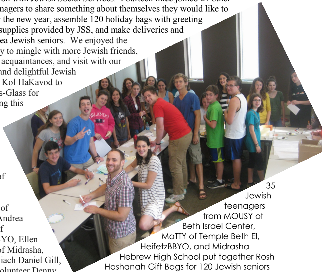
35 Jewish teenagers from MOUSY of Beth Israel Center, MaTTY of Temple Beth El, HeifetzBBYO, and Midrasha Hebrew High School put together Rosh Hashanah Gift Bags for 120 Jewish seniors all about Madison in conjunction with Jewish Social Services. What a mitzvah!