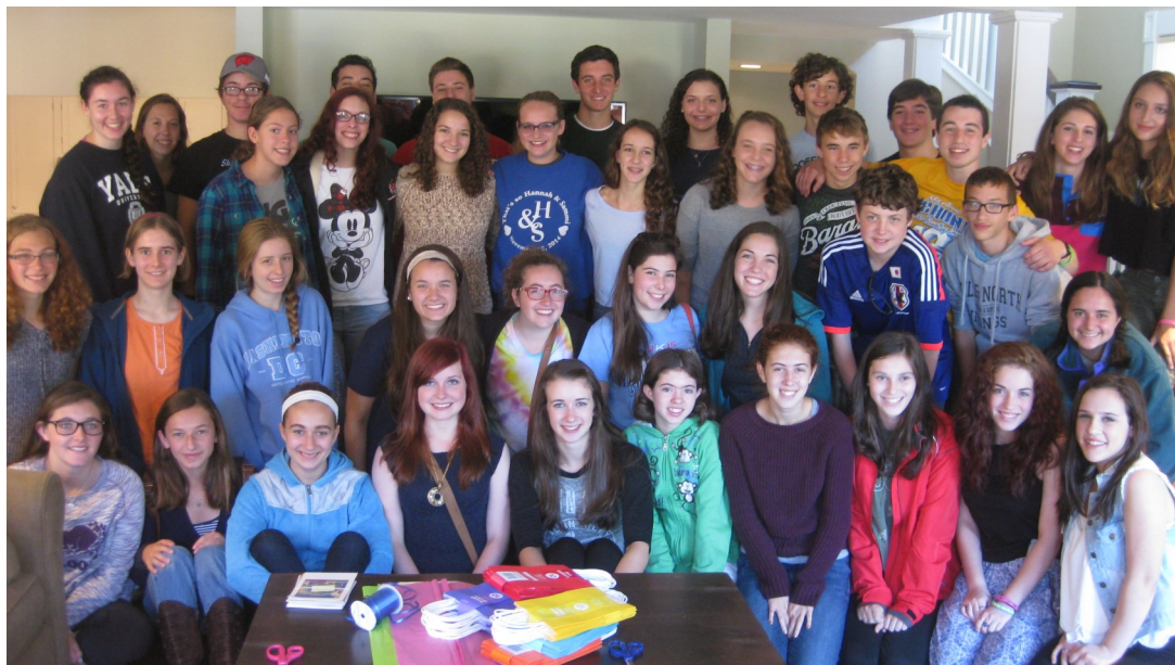
40 Jewish teenagers from MOUSY of BIC, MaTTY of TBE, CSS, and BBYO put together Rosh Hashanah Gift Bags for nearly 60 Jewish seniors all about Madison in conjunction with Jewish Social Services. What a mitzvah!