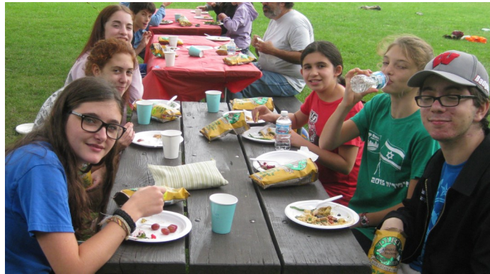
A bit of tuna nicoise, baklava and rugelach desserts, veggie and pasta salads, raspberry lemonade, marvelous MOUSY mice and Kadima kids, and pleasant parents made for a fun Sunday Veg-out in the Park with BIC youth families.